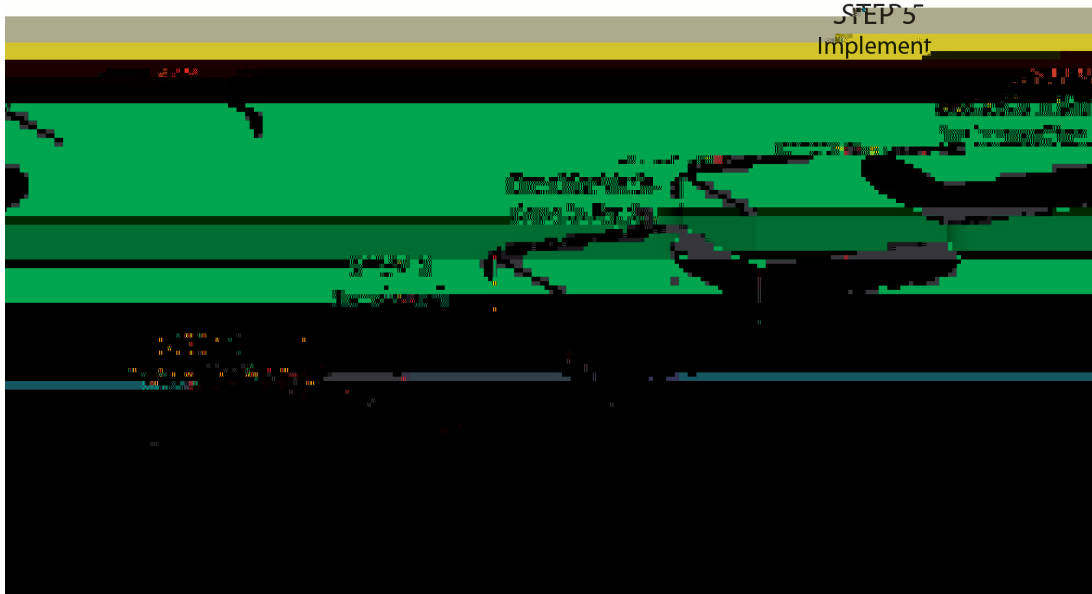
Figure 4: Step 1 of the Recruitment and Hiring System Toolkit

Step 1 engages your organization in an audit to assess the equity of your Recruitment and Hiring System.